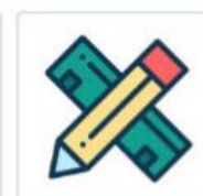
SAFE SCHOOL STUDENT AMBASSADOR