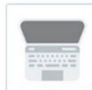
AFTER SCHOOL CODING PROGRAM