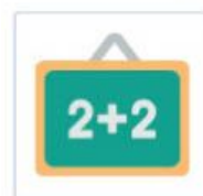
AFTER SCHOOL STRATEGIC TUTORING